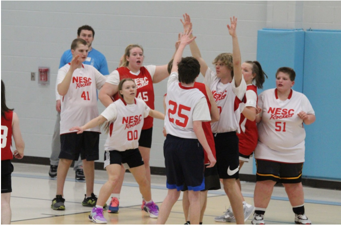
Fellow NESC teams battle it out on January 17, 2023. The teams pictured above competed in the senior division. The tournament was hosted at Hamlin, and around 250 athletes and coaches attended.