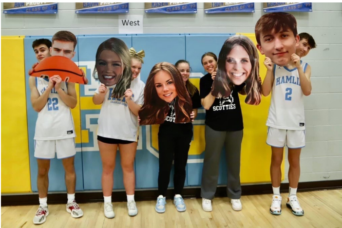
Senior Night