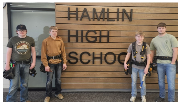
Above: Shop class students stand next to the new high school office. Below: Inspirational words in the new addition.